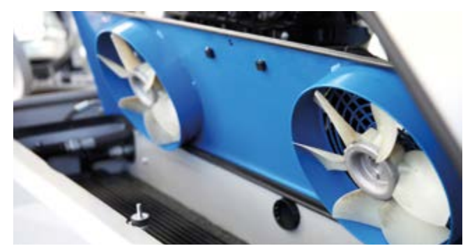
Patented cooling system