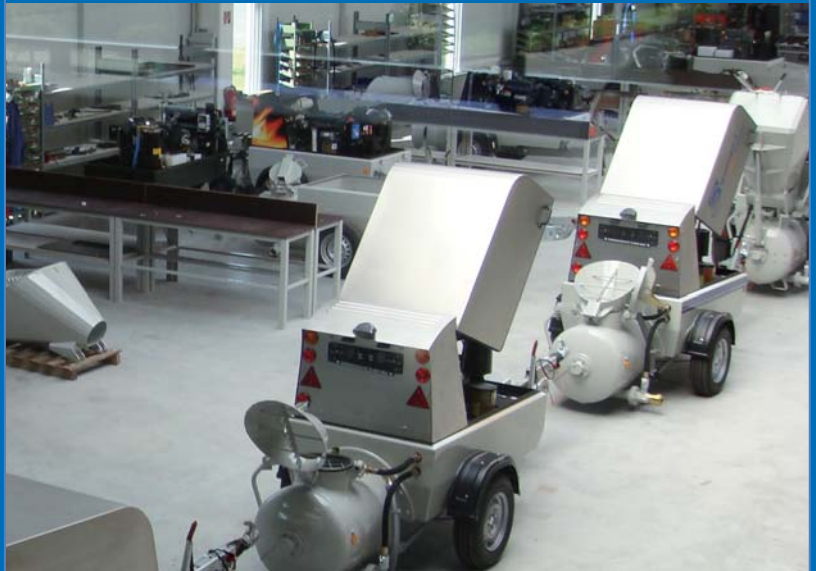
View of the production hall of BMS

The name Bau-Maschinen-Service AG honours what it promises. As behind the name there is a team knowing the construction industry from its own experience. We exactly know what conditions are given on site. What is expected from a specialist for screed, mixing and conveying equipment such as BMS. What matters is quality, reliability and schedule effectiveness so that orders can be executed to the utmost satisfaction of the customer!